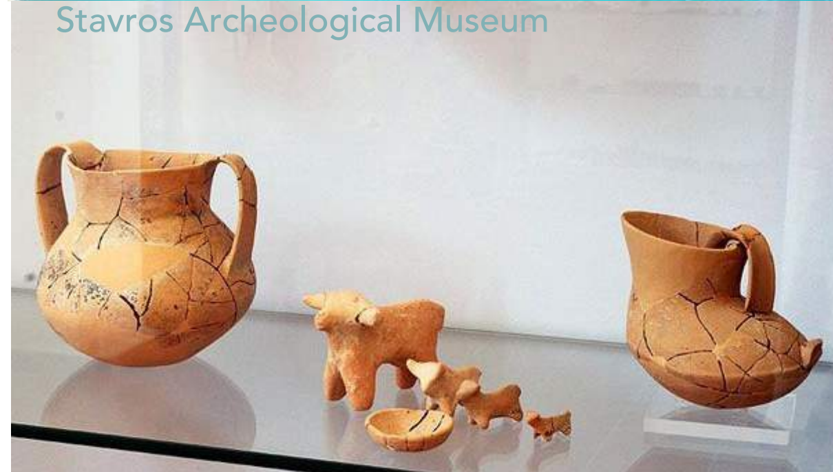
Stavros Archeological Museum