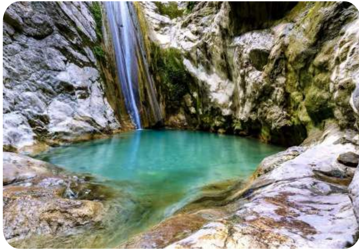
WATERFALLS OF LEFKADA

Today we will travel to a diamond in the Ionian Islands, Kefalonia, on the way we will journey through the neighbouring Island of LEFKADA, here we will explore just a small taste of this Island before embarking our boat to our final destination today