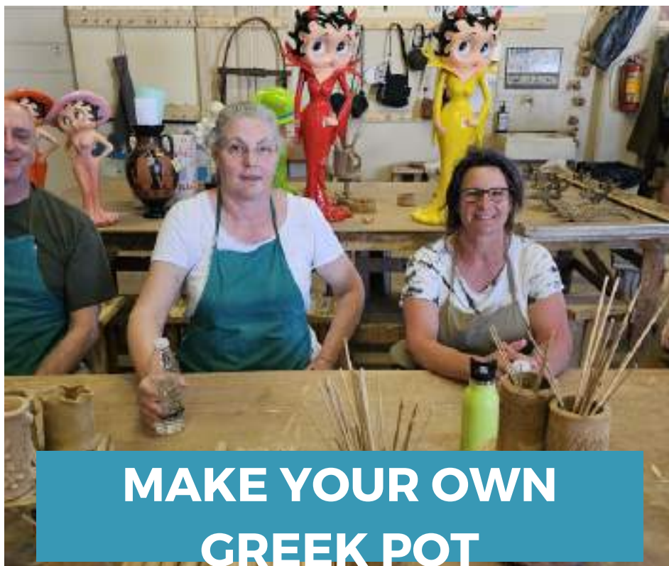
MAKE YOUR OWN GREEK POT