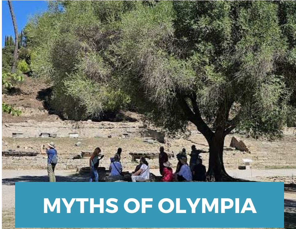
MYTHS OF OLYMPIA

Our Kefalonia adventure winds up as we now travel by boat to the port of Kypseli, from here we will drive to the sacred site of Olympia. This is one of the most beautiful stops, steeped in history full of stories of the Olympians. We will before leaving we will visit the museum and lunch together. Destination, NAUFLIO.