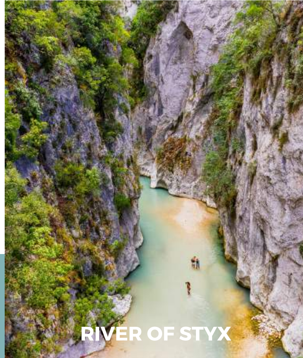
RIVER OF STYX

Acheron River, situated in the Epirus region of north west Greece. Also known as the river of woe and one of five rivers in the underworld, where souls of the dead are ferried across.