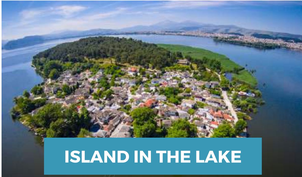
ISLAND IN THE LAKE

During our travels to Parga we will spend time to visit the town of Ioannina, we'll explore its highlights: the island in the lake, the historic castle, the Silversmithing Museum, and the mystical Cave of Perama. After lunch we will head to the beautiful town of Parga, where we will be exploring tomorrow.