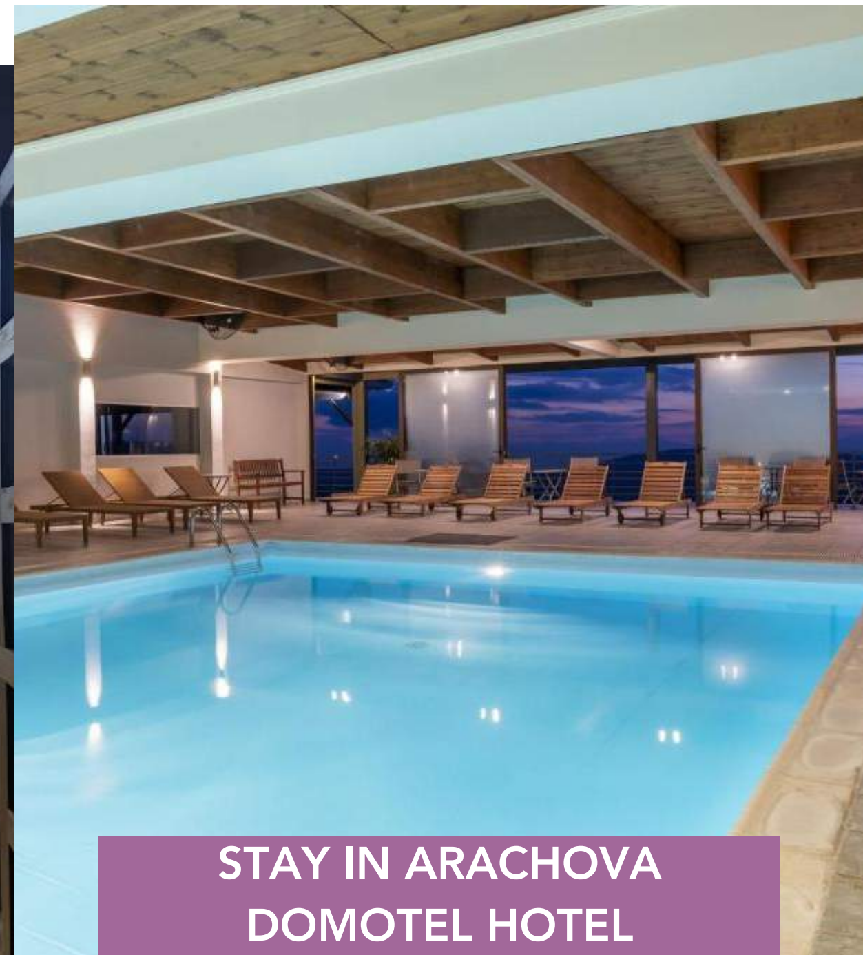
STAY IN ARACHOVA DOMOTEL HOTEL

The Monastery of Osios Loukas, is renowned for its stunning Byzantine mosaics. The mesmerizing mosaics, adorned with vibrant colors and intricate designs, offer a glimpse into the religious and artistic traditions of the Byzantine Empire, making the Monastery of Osios Loukas a must-visit destination.