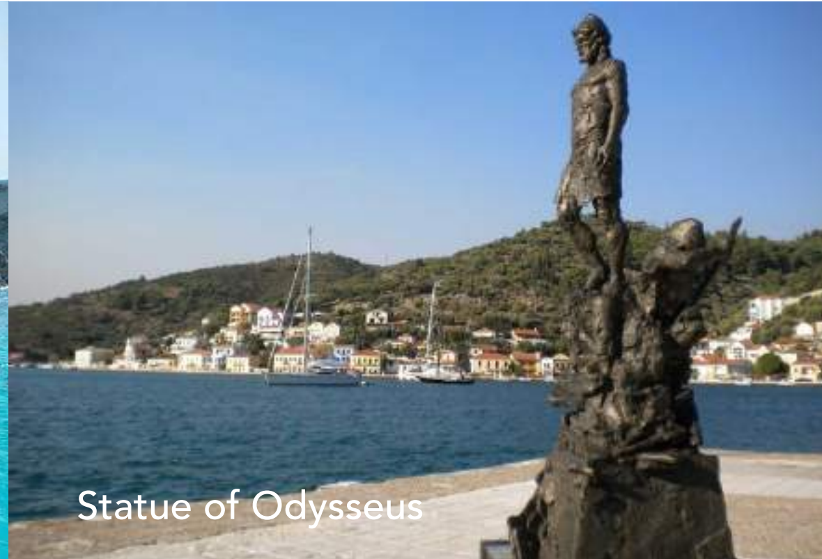
Statue of Odysseus