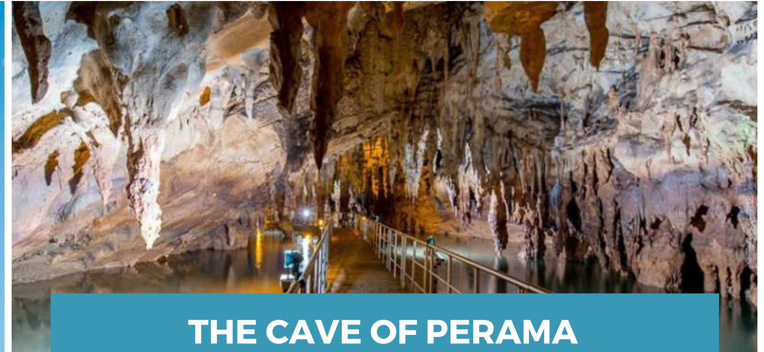
THE CAVE OF PERAMA