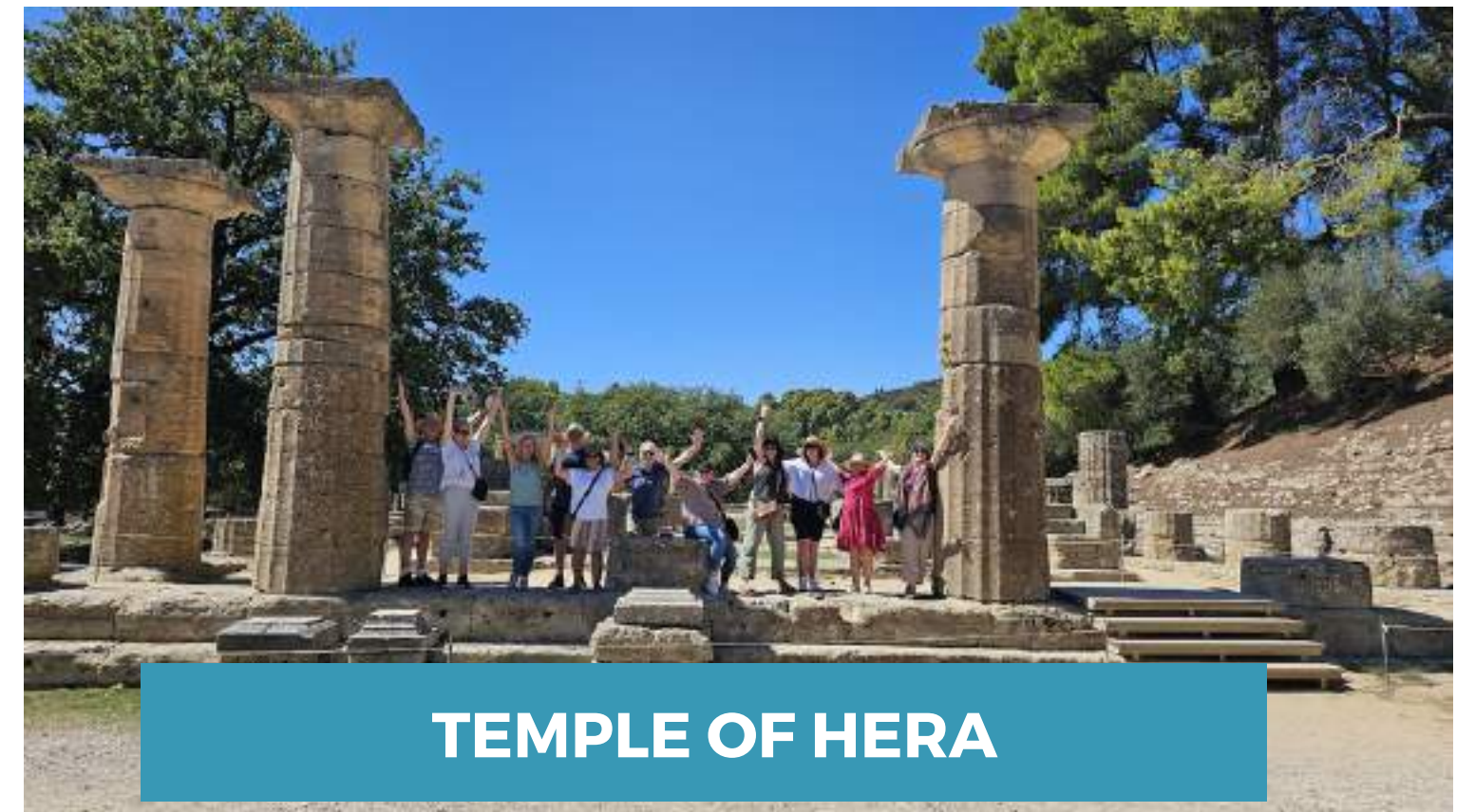
TEMPLE OF HERA